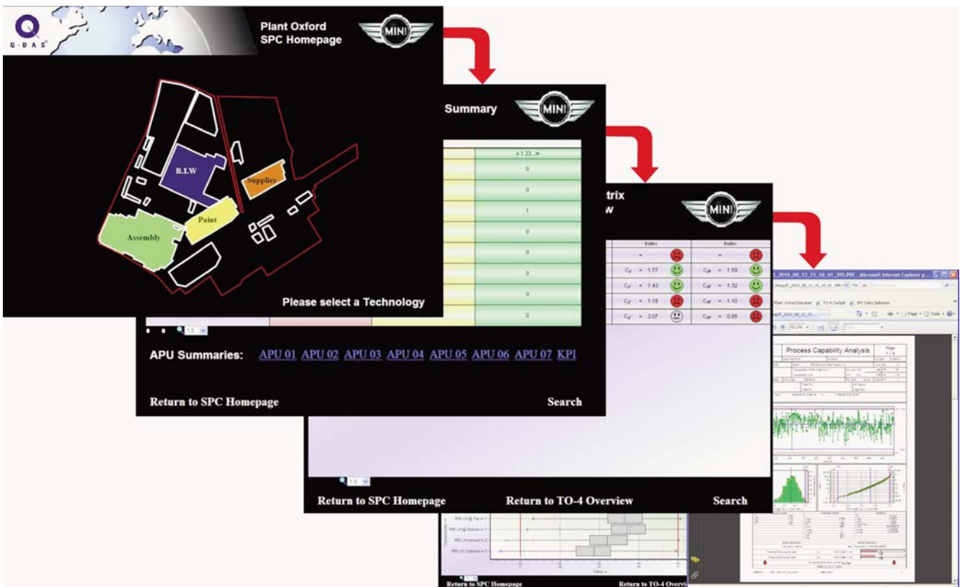
Figure 3: Websites for evaluations via intranet

Mini.... a success story to be continued!