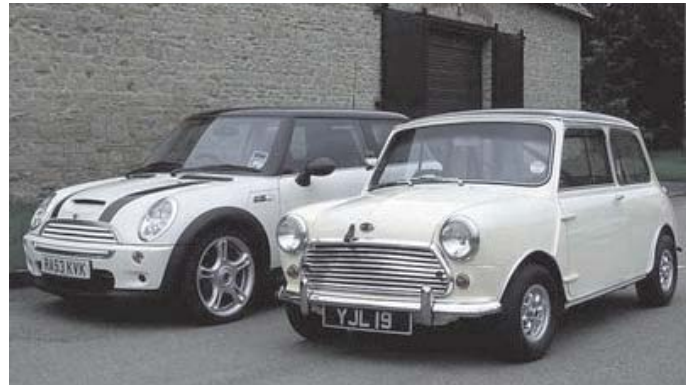
Figure 1: The Mini - then and now

In the past, measurement and test data was recorded manually by using pen and paper in the assembly department. Data were collected once a week in order to conduct a rudimentary process analysis. A real statistical evaluation including a “drill-down functionality” was not feasible because of the data structure. The first Q-DAS® licenses were installed in 2003. These licenses were single-workstation solutions, i.e. there was no system network. However, the single-workstation solutions provided the basis for implementing the Q-DAS® software in the entire final vehicle assembly.